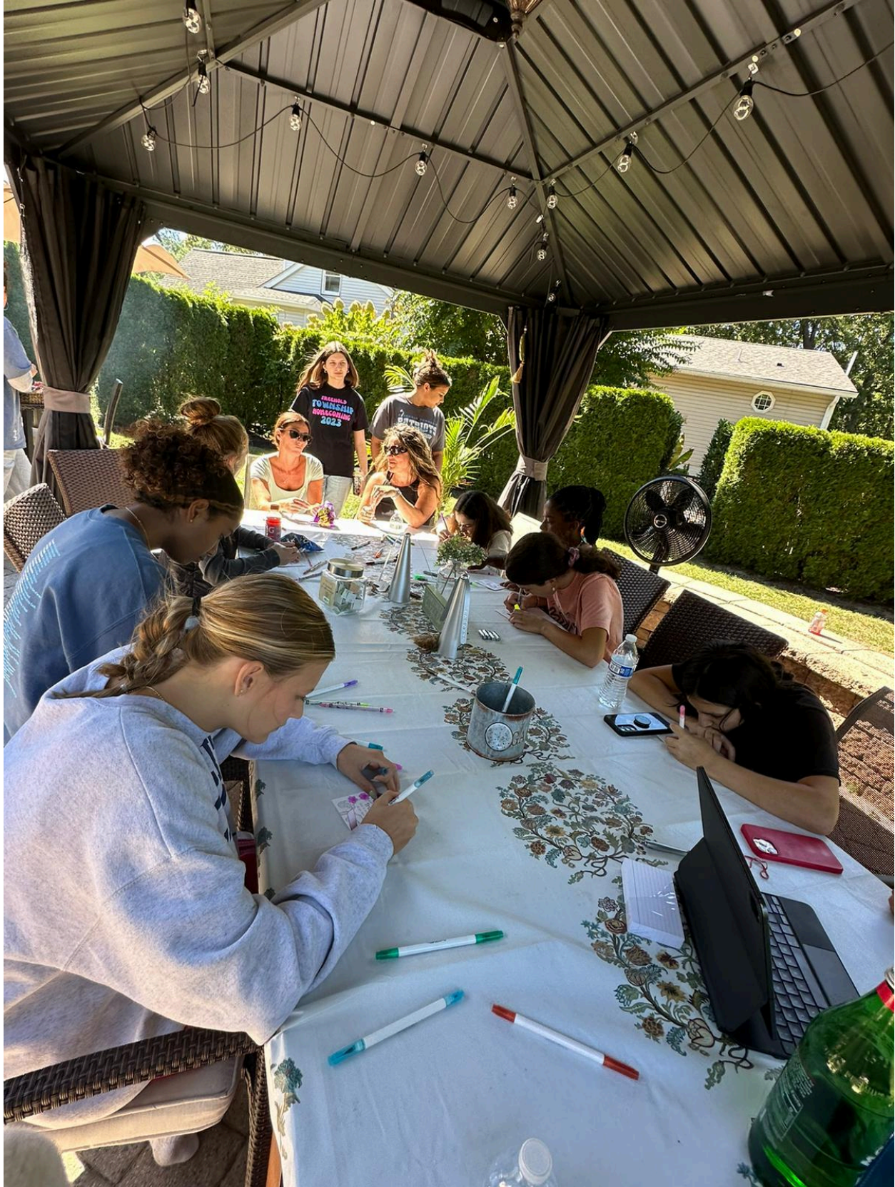
2. Old Bridge Day September 21st